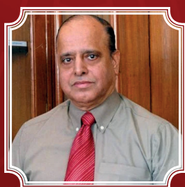
Padma Vibhushan Dr. K. Kasturirangan